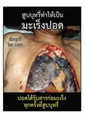
Design number 9