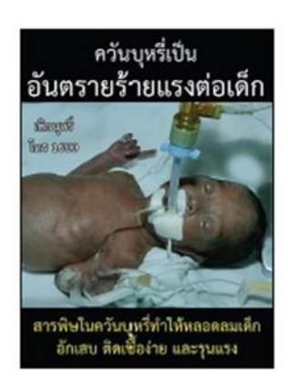
Design number 1

Subject: Criteria, methods and conditions on tobacco product and cigarette packaging B.E. 2561 (2018)