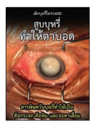
Design number 5