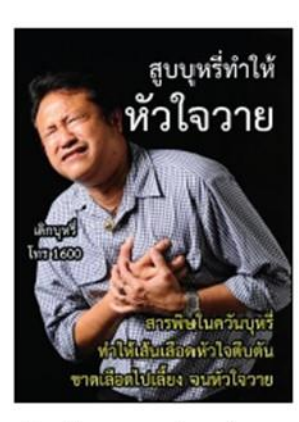
Design number 6