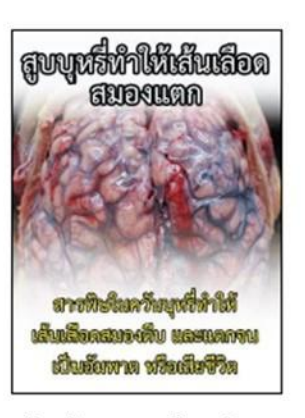
Design number 8