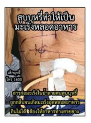
Design number 7