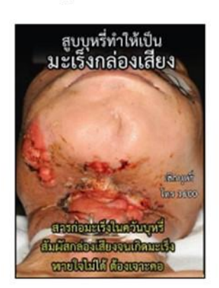
Design number 10