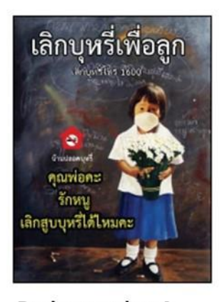
Design number 4