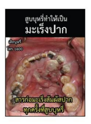
Design number 3