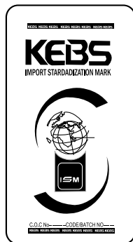
Import Standardization Mark SYMBOL FOR PRODUCT QUALITY