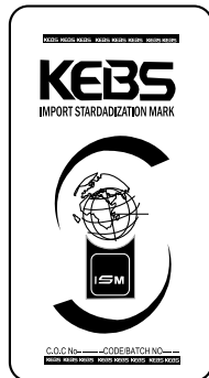
Import Standardization Mark SYMBOL FOR PRODUCT QUALITY