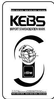
Import Standardization Mark SYMBOL FOR PRODUCT QUALITY